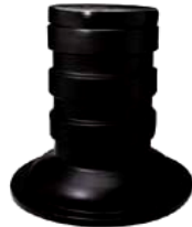
LID & RISER